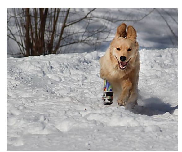
High-Tech Pet Prosthetics Give A Leg Up To Man's Best Friend