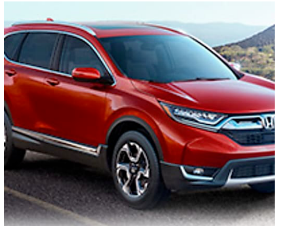
Why These 10 SUVs are the Cream of the Crop