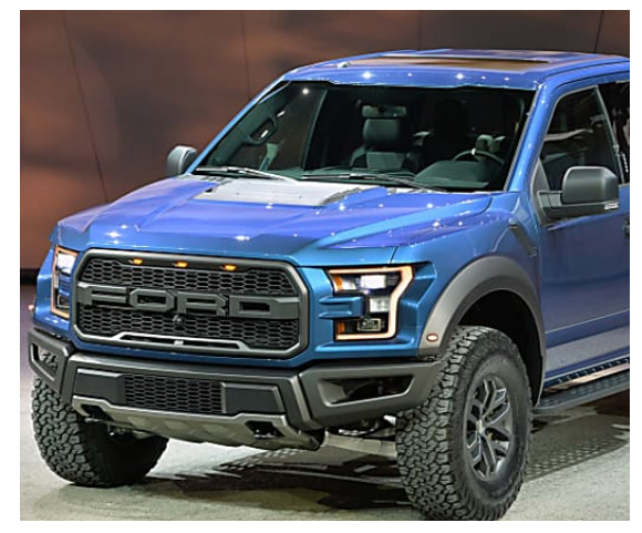
Dealers are Clearing 2016 Pickup Truck Inventory. Browse Clearance Deals Today.