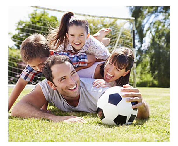
What Kind Of Sports Parent Are You?