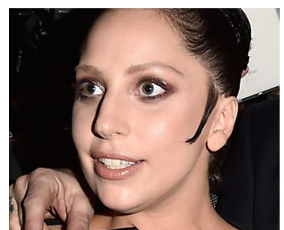
Lady Gaga's Dress Leaves Little To The Imagination